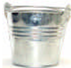
MET-B275 3-1/4" dia., 3" tall