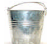
MET-B375 4-1/8" dia., 3-7/8" tall