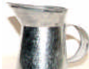
MET-P2 2" dia. - 2-3/4" tall