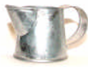
MET-MP 1-1/2" dia. - 1-7/8" tall