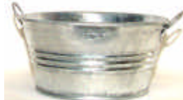
MET-6542 4" dia., 2" tall