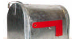
MET-MB 5-1/4" long, 3-3/4" tall, 3" wide