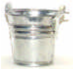
MET-B2 2-1/4" dia., 2" tall