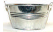
MET-6541 5-1/4" dia., 2-3/4" tall