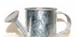
MET-WC 2" dia., 2-1/4" tall